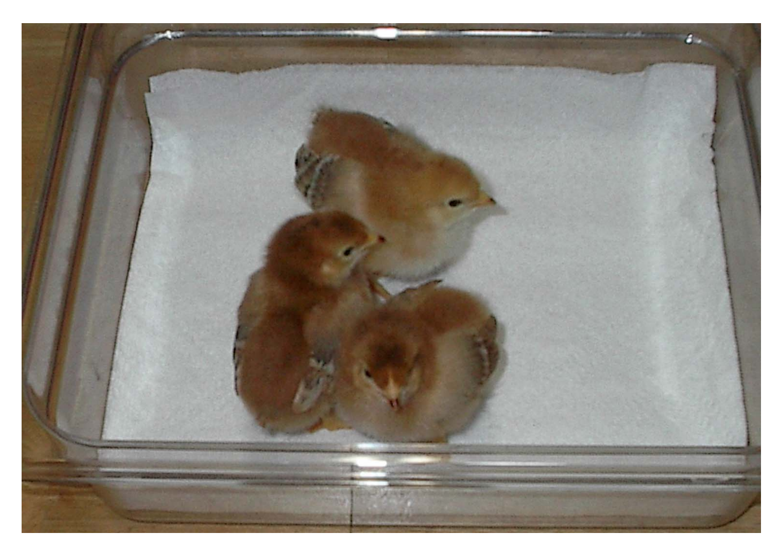
Six days old