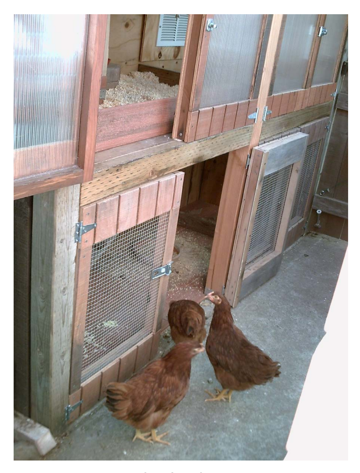
Coop, Sweet Coop